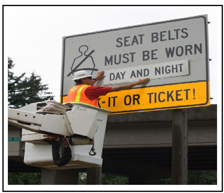
A roadside sign in Washington State is updated to reflect the importance of buckling up both day and night.

NHTSA is examining experience and evidence concerning nighttime seat belt programs. This paper shares information collected to date that could help law enforcement agencies plan successful nighttime seat belt emphasis patrols for the next CIOT Mobilization. In addition to the following, two detailed research papers with results from several of our recent nighttime belt enforcement projects are expected in the fall of 2008.