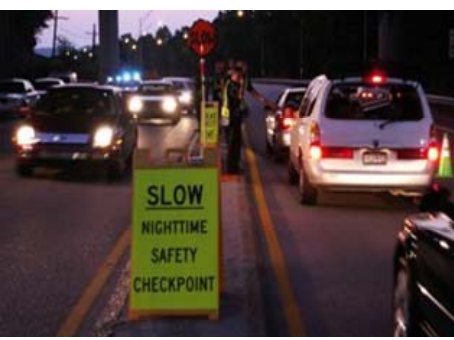
Charleston, West Virginia's Safety Enforcement Zones

❖ Washington State initiated a pilot project called Take the Fight to the Night , to test the outcome of conducting seat belt enforcement at night. Washington State has one of the highest daytime belt use rates in the country at 96 percent, but continues to experience a high number of unrestrained fatalities. Led by the Washington Traffic Safety Commission (WTSC), law enforcement teams placed a "spotter" in locations where there was sufficient ambient light (such as at off ramps or other brightly lit areas). Whenever the "spotter" officer viewed an unbuckled occupant, the next step