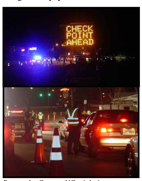
Buncombe County, NC, nighttime enforcement