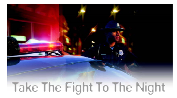
The Washington State Nighttime Seat Belt Enforcement Project

Visit the WTSC website, <a href="www.wtsc.wa.gov">www.wtsc.wa.gov</a>, for information about their program, the Washington State Patrol law enforcement training video, program planning documents, data collection sheets, talking points and preliminary findings.