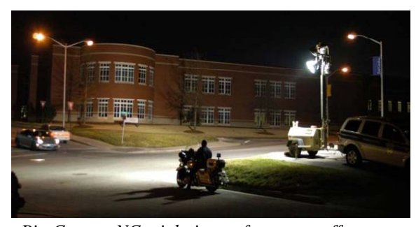
Pitt County, NC, nighttime enforcement effort

Greenville Police Department partnered with several other local agencies. However, the effort did not receive much earned news media attention.