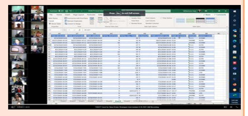
Participants learning from each other while sharing their respective analytical products during live virtual session

The training workshops, created by Analytical Specialists Dawn Reeby and Debra Piehl, were designed so each workshop could be attended as a stand-alone course or as part of a training series, with each subsequent training workshop building upon the previous. The workshops provided analysts with the opportunity to receive up to eighty seven (87) hours of virtual online training. The workshops created were 1) Data Analysis Using Microsoft Access- Basic (24-hours) and Intermediate (14-hours) levels, 2) Data Analysis Using Microsoft Excel- Basic (21-hours) and Intermediate (14-hours) levels, and 3) Tactical Analysis (14-hours). All of the courses addressed or reinforced the fundamentals needed to implement a data-driven crime and crash reduction operational model and provide tools