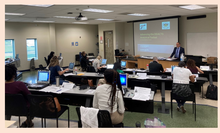
August 2021- Analyst attending a Level II-Intermediate Workshop in Harris Co Sherriff's Training Center

Most importantly, the efforts in FY 2021 have proven to be successful and well-received as noted in two anonymous student evaluations - "I loved that I could apply the