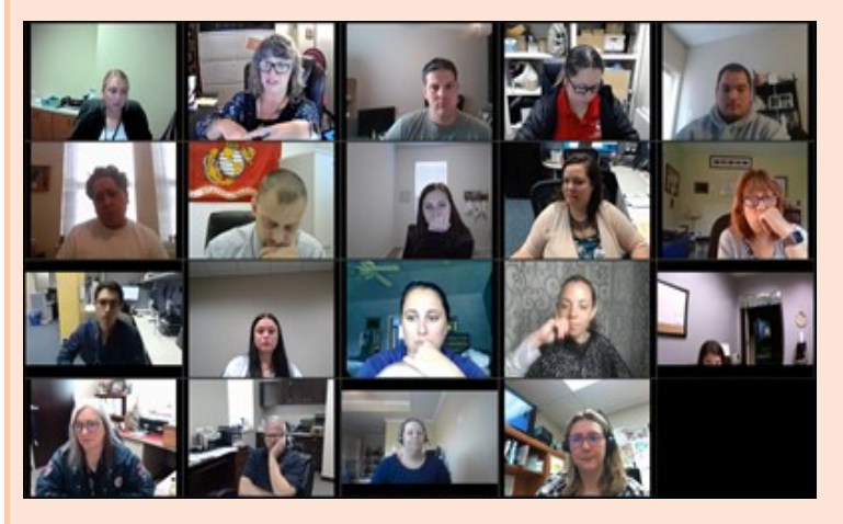
Screen shot of participants attending a virtual training

By the end of the FY 2021 grant period, a total of one- IADLEST is proud of the participants and their agencies hundred and fifty-three (153) law enforcement profes- for their openness to tackle change and implement sucsionals representing forty-five (45) local, county, and cessful, long-term, data-driven strategies. IADLEST state law enforcement agencies throughout Texas attend- looks forward to another successful year providing releed at least one of the ten (10) multi-week virtual work- vant and high-quality training as TxDOT has awarded shop sessions. Additionally, another forty-four (44) ana- grant funding in FY 2022 for both the Texas-DDACTS lytical personnel attended one of the three 2-day in-person and the Large Truck and Buss Traffic Enforcement Trainworkshops (two Level-Basic and one Level II- Intermedi- ing projects. ate).