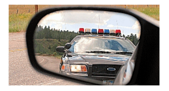
BUZZED DRIVING IS DRUNK DRIVING