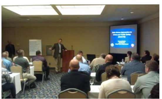
Participants at a DDACTS workshop in San Diego, California

The 16-hour workshops open with 4 hours of lecture on DDACTS guiding principles and case studies from agencies who have implemented it. Participants are then divided into three discipline groups—commanders, supervisors, and analysts—for 6 hours of structured discussion about the DDACTS guiding principles and the obstacles that the participating agencies face in following them. After the discipline group discussions, the participants get back together with the other representatives of their agencies to craft a synthesized implementation plan, which they present to the entire group on the final morning.