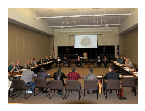
Armenian officials meeting with Kansas law enforcement representatives at KLETC:

At the present time, it appears the Kansas-Armenian law enforcement partnership will continue with additional future opportunities to exchange information and ideas.