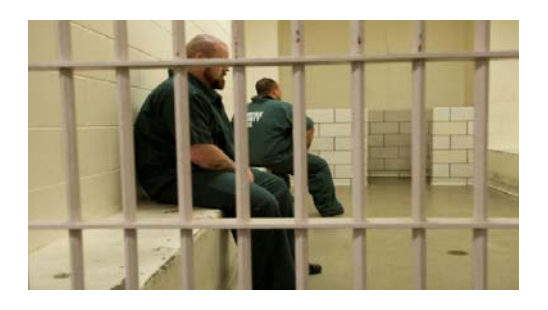
Secure Communities helps ICE prioritize the removal of criminal aliens who pose the greatest threat to public safety

Through the Secure Communities strategy, ICE improves public safety every day by transforming the way criminal aliens are identified and removed from the United States. As part of this strategy, ICE uses an existing federal biometric information sharing capability to identify aliens when they are arrested for a crime and booked into state or local law enforcement custody. The federal biometric information sharing capability, or IDENT/IAFIS interoperability, enables ICE to identify aliens in law enforcement custody more quickly and accurately using biometrics—in this case, fingerprints.