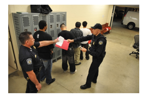
Through Secure Communities, ICE improves public safety by supporting law enforcement and removing criminal aliens from their communities.

shared through the state identification bureau can now include criminal history, immigration status, and identity information, which may be useful for officer safety and for investigative purposes if the law enforcement agency is capable of receiving the immigration response.