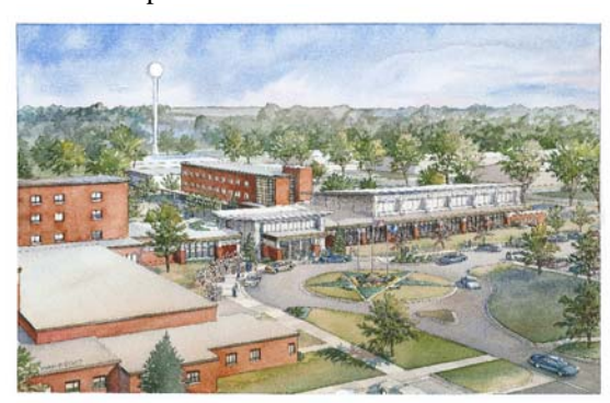
Architectural rendering of the New Kansas Training Training Academy

After a complete review of the Phase I construction bids, the State of Kansas awarded the contract to the Wichita-based Law Company. The Law Company's experience is diverse with an excellent reputation for building shopping centers, regional malls, major department stores, community retail centers