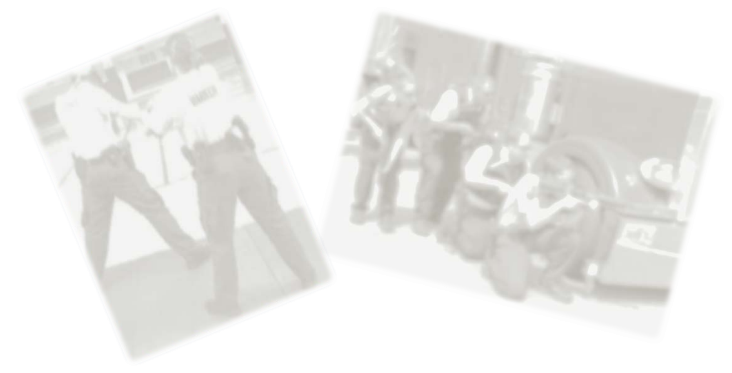
Utilizing the Sports Medicine Model